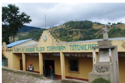
Tzanixnam Municipal Building