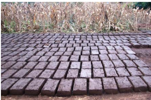
First phase - the adobe crop!