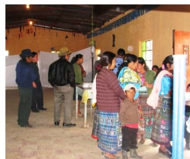
Men in Hats are the committee watching how we worked in clinic - We passed inspection!

Once in Choacaman IV we left to do a home visit with a woman in the area that is dying from cancer. One of our volunteer health promoters from the church and his wife and sister in law asked to go with us so we all headed out. It was uplifting to us, because they came in with us and offered to sing a song first and then prayed with the patient and shared the gospel with her. They were very nurturing and followed us as we went to visit another family with a sick mother. What a privilege to work side by side with our brother and sisters, administering the love of God.