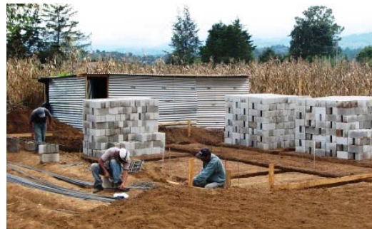
Second phase - start the foundation